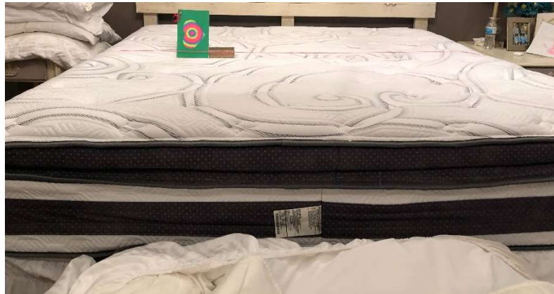
Unmade Mattress, showing entire mattress & straight edge (Straight edge required if sagging is issue) Picture above is string with washer tied to each end an 2x4. Broom handles work as well.