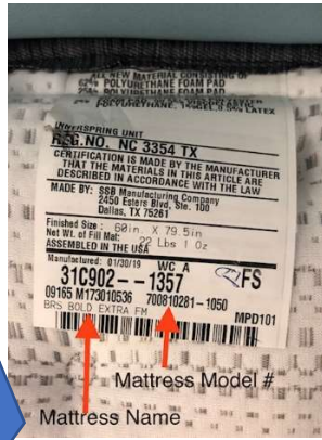
Lawtag: Name of Bed, item # & bed # (begins with "m")